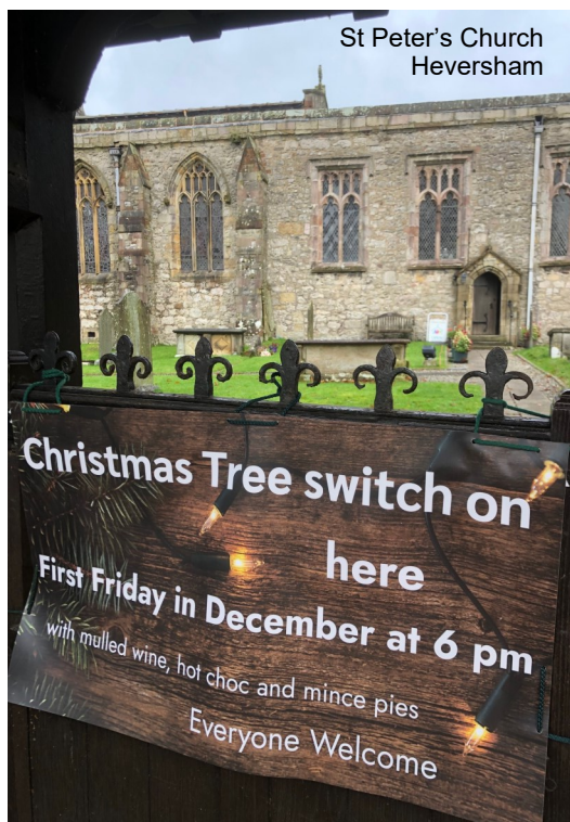
St Peter's Church Heversham