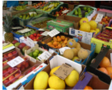
photos taken at Milnthorpe Market

For the NOVEMBER issue please submit articles/notices in writing/email by 15th OCTOBER please -